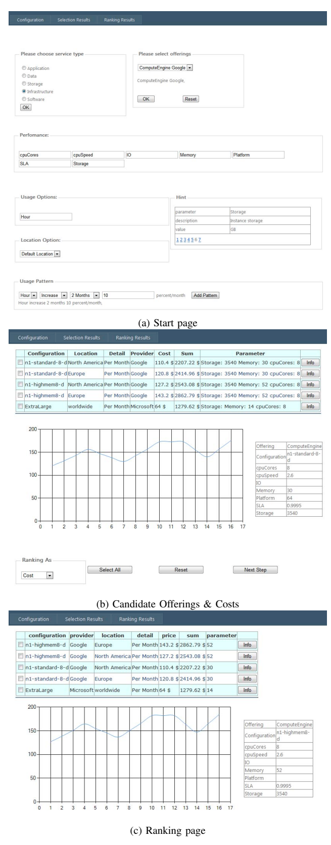
Figure 4: MDSS interface pages

of ranking the results of the selection in Fig. 4b by size of RAM. All the information from the previous screen is available, meaning that the user can access both the complete information for the offering, and the curve illustrating the cost calculation. Ranking by different criteria can be initiated by the same screen; the result of multiple rankings is currently however not cumulative. This functionality is currently under development.